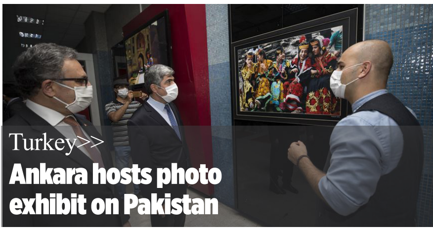
Turkey>> Ankara hosts photo exhibit on Pakistan