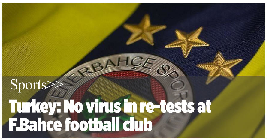
Sports>> Turkey: No virus in re-tests at F.Bahce football club