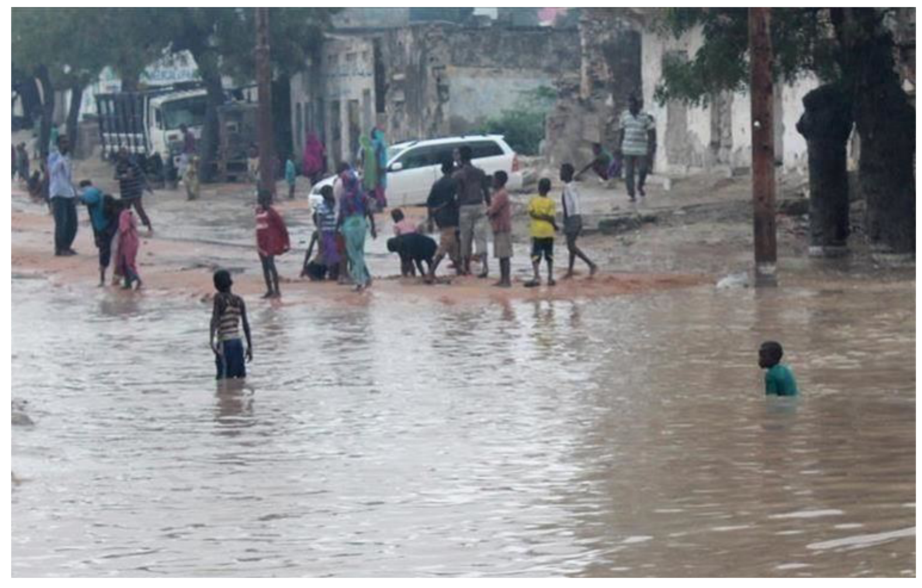
Wet season, which normally lasts from March to May, has affected nearly million citizens